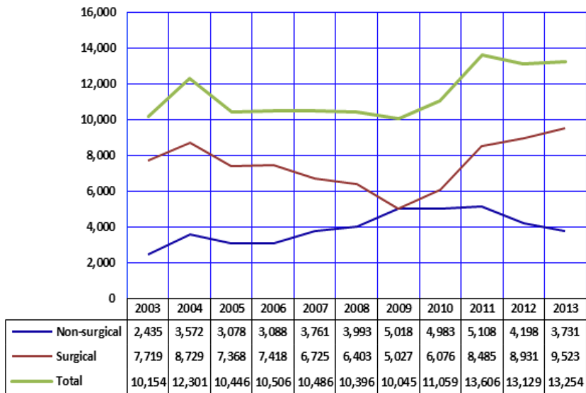
Figure 1D-2 Trends in the Number of Surgical and Non-Surgical Abortions by Year, Arizona Residents, 2003-2013

The rate of induced terminations of pregnancy per 1,000 female residents aged 15-44 increased slightly from 10.2 in 2012 to 10.3 in 2013 ( Table 1D-1 ). The relative stability in the abortion ratios and rates from 2011 through 2013, when compared to the variability observed from 2010 to 2011, reflects the new reporting abortion requirements implemented mid-year in 2010.