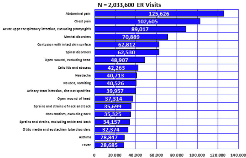
Figure 4C-1 Number of Emergency Room Visits by the Leading Diagnostic Groupings, Arizona Residents, 2012

Note: Based on first-listed diagnosis; See Table 4C-2.